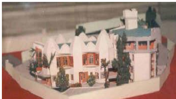
Three dimensional model of the Jubilee Centre

The Center will provide worship space for nearly 1,000 plus a school, a medical center, an outreach center, and a community center for Freetown. It will serve as a beacon to the Sierra Leone people that Lutherans, who have only been in Sierra Leone for the