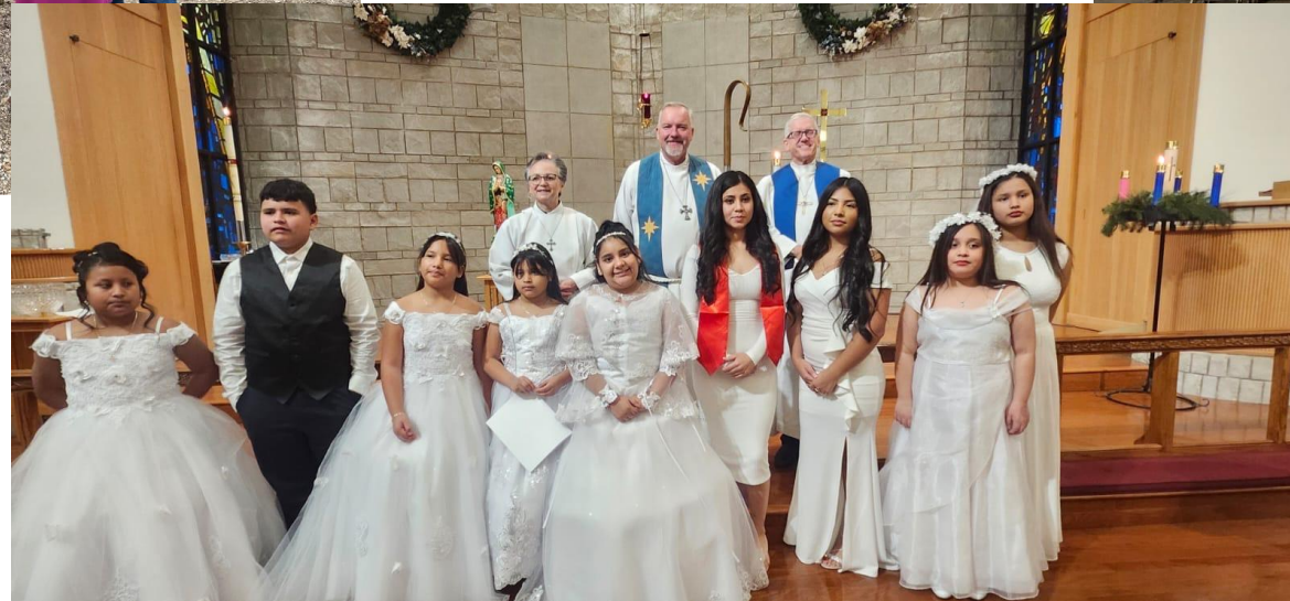
Primeras Comuniones y Confirmaciones at Adviento-Arlington