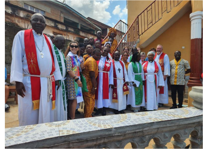
Worship at St. Marks-Calabatown