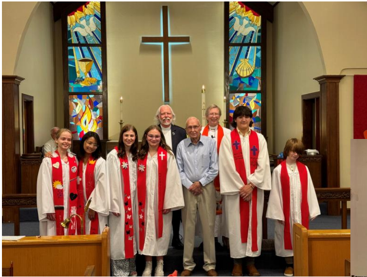
Confirmation at Shepherd King- Lubbock