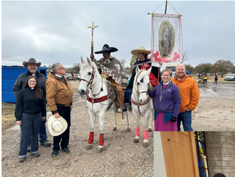
Cabalgata at San Gabriel-Alvarado