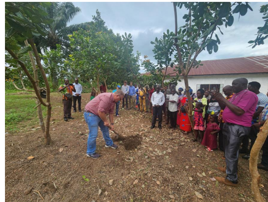
Ground breaking on Church Expansion