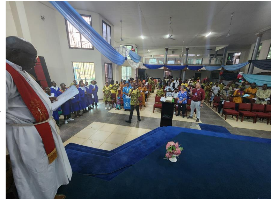
Rededication of the Jubilee Center