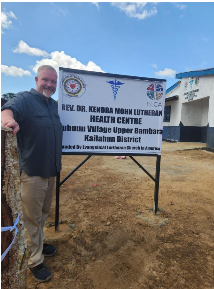
Dedication of Women's Health Clinic