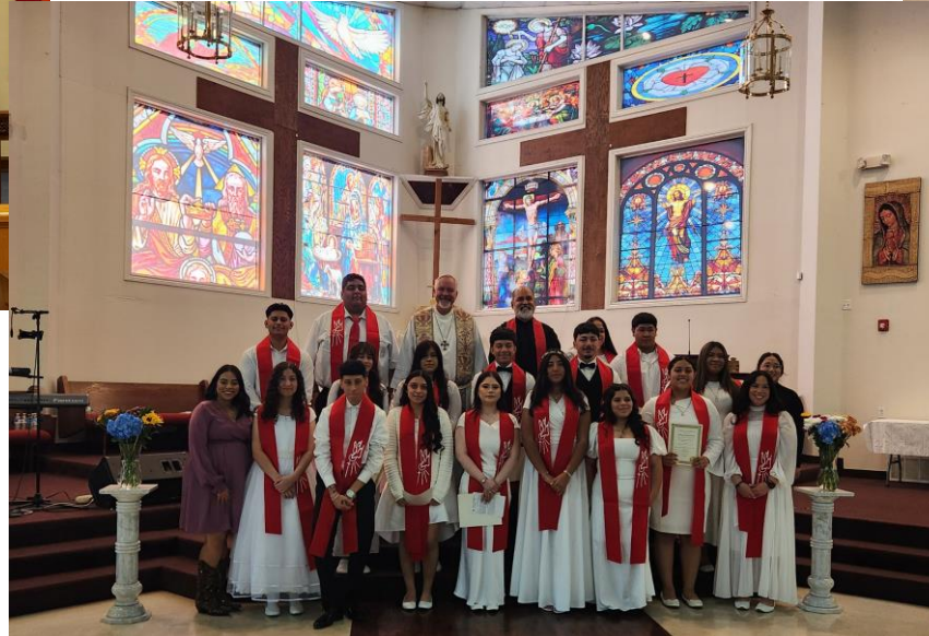
Primeras Comuniones y Confirmaciones at Santa Maria-Irving