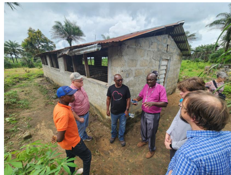
Learning about Livestock Sustainability Program