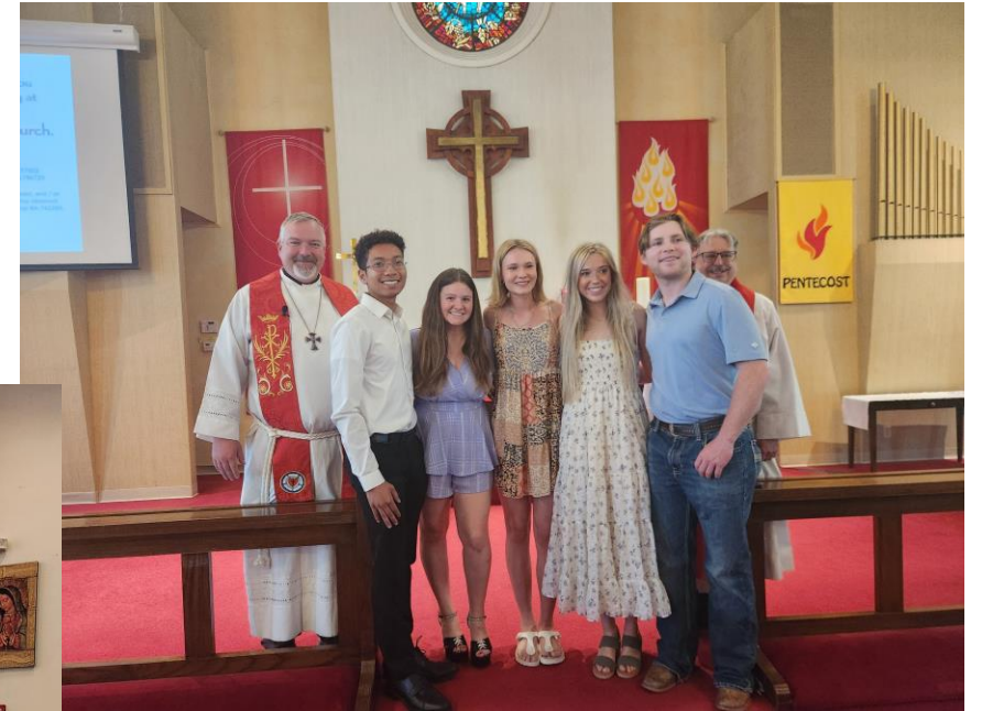
Confirmation at Calvary-San Angelo